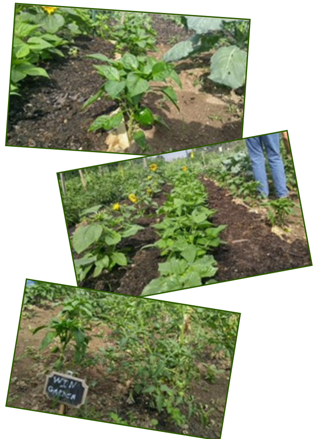
An assortment of vegetables are on display in the WIN Services garden including, tomatoes, green peppers, green beans, cabbage and sunflowers.

Thanks so much for your “Hart-felt” efforts in helping BCRC participants find their great talents. ■