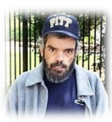
Joe Johnston June 2016