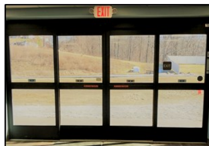
New client entrance.

The effect of the glass doors in the lunchroom is immediate and uplifting. Natural light now flows through the lunchroom into the work area. Clients can glance outside when they eat or work and get a glimpse of